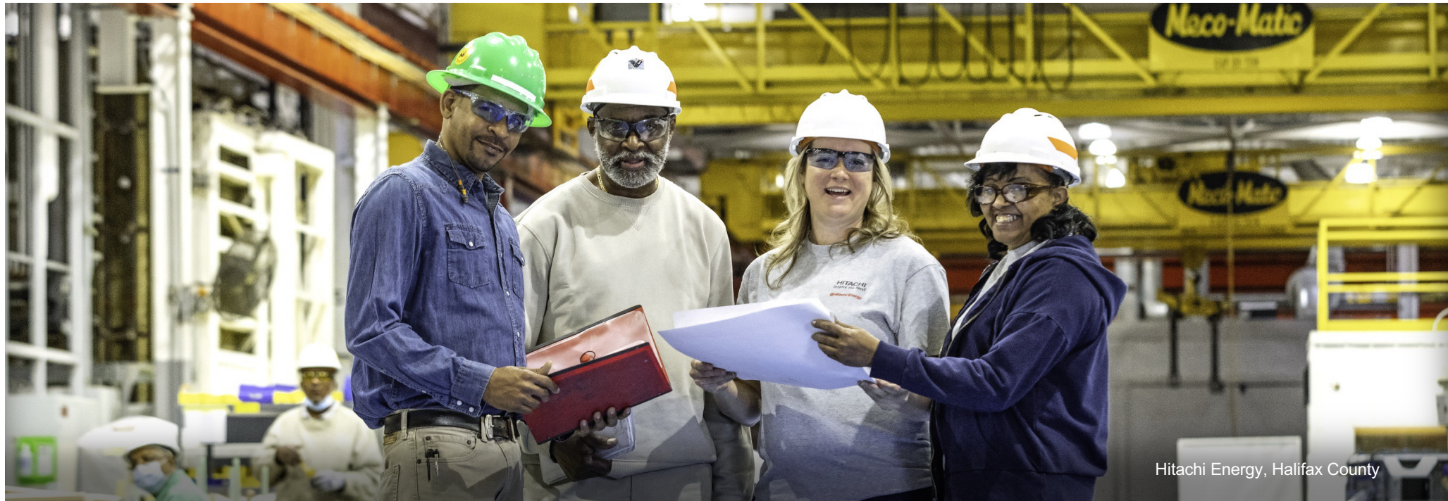
Hitachi Energy, Halifax County